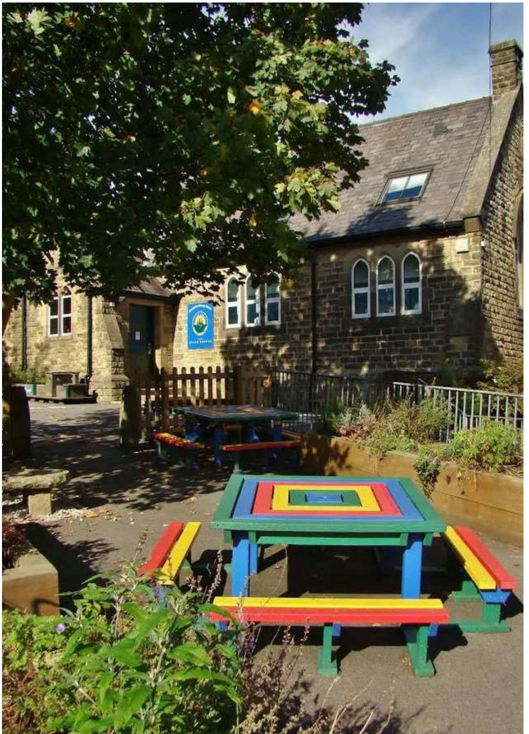
OUR BEAUTIFUL GRINDLEFORD SCHOOL