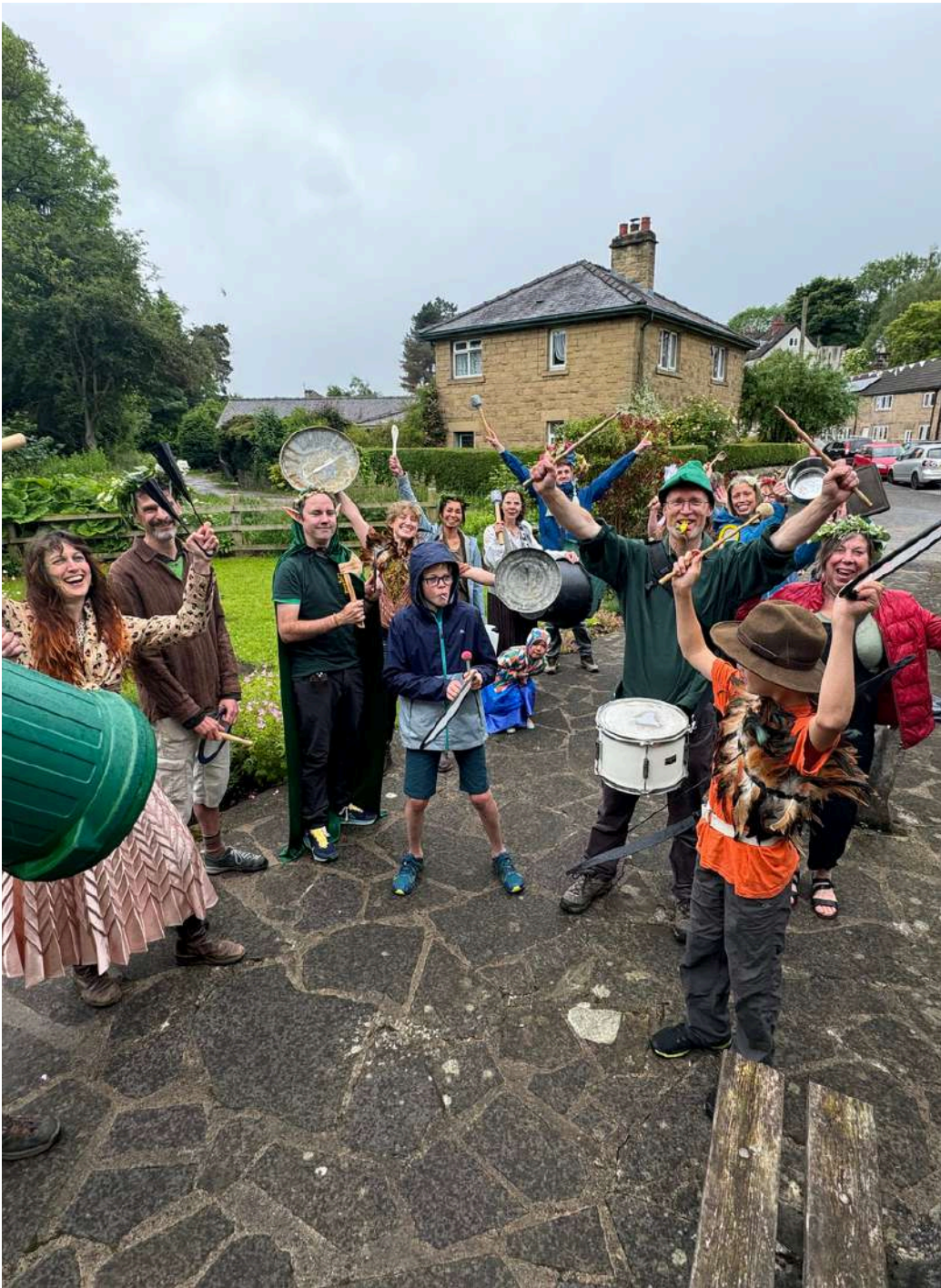
Grindleford make some noise!