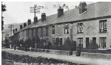
LONG ROW 1920

Very few field-names are in use today, the handful known would probably include Bridge Field, Bonfire Field and the Butterfly Field, but not too long ago virtually every field would have been known by name to many villagers. Fortunately, field-names in the former parish of Stoke are recorded in a sales catalogue of 1937 when the Stoke Hall Estate was auctioned.